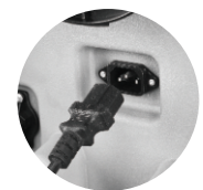
Quick power cord connection