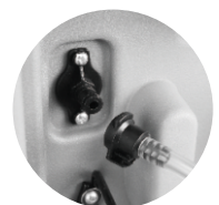
Quick draining connection