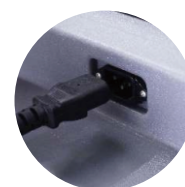
Quick power cord connection