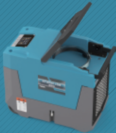
Easy Cord & Hose Storage