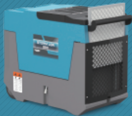
Easy Filter Access