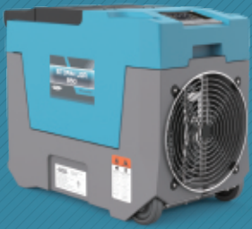
Easy access to all components