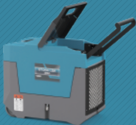
Fold- Down with Wheels for Transport